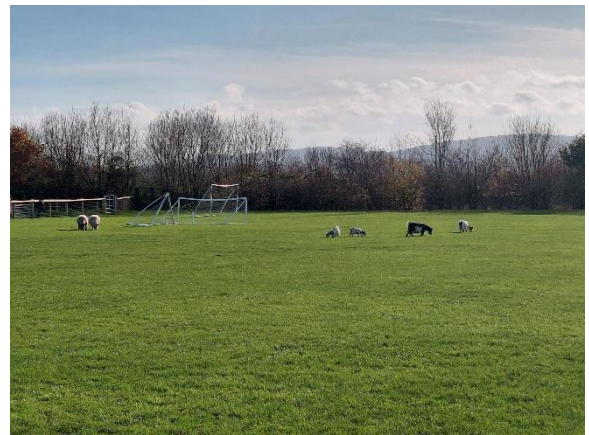
Above: Our sheep and goats roaming our school field.