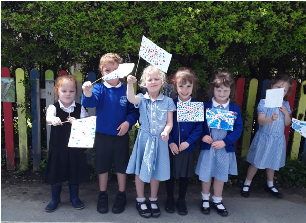
Oak Class made flags to wave.