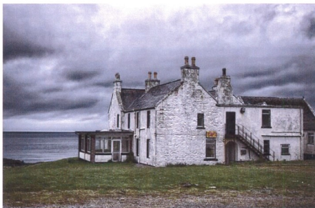
Stone's Estate Agency £399,999