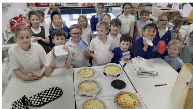
Maple Class made Coronation Quiche to celebrate.

All the classes did their own thing to celebrate King Charles III's Coronation.