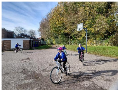
Above: Just getting used to hand signals before we go out onto the road.

Once you complete your MOT check – check your tyres, breaks work, chain goes round and everything is safe to ride. Then off you go!