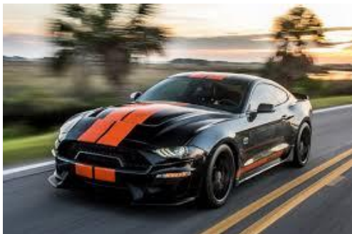
Above: 2019 Ford Mustang Shelby GT-S

In our opinion the best cars are BMW M3 comp (Ethan's) and Ford Mustang GT (Edwards).