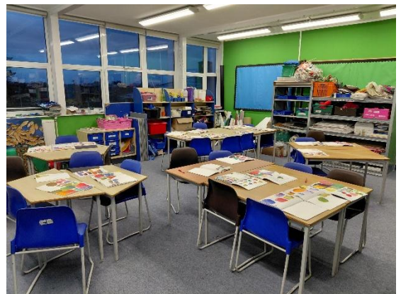
Above: Our new Art Room.

Making art is fun for children and adults because they can use their imagination to make pictures, which can be used to make lots of things like cards and stickers. Everybody enjoys creating art about things they love best whether it's football, animals or imaginary worlds. Every work of art inspires people to create their own masterpiece, and displaying children's art makes school interesting and colourful.